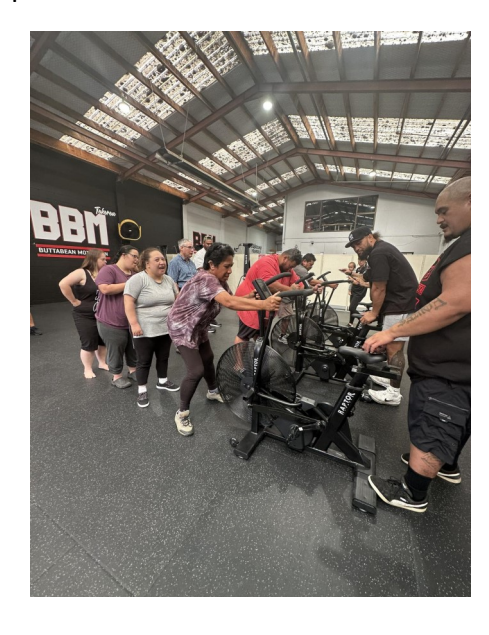
BBM GYM - TOKOROA

A new program this year at the BBM Gym for our CREATIVE ART - Community Participation Groups. They are really enjoying it and it is great to see them trying different programs for their fitness & to see them trying to improve their fitness! WELL DONE, ALL!