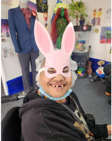
Above: What a 'Cute Bunny!