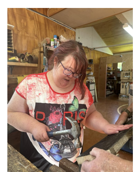
Who said 'THE MENZSHED' is for men only!