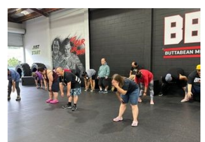
SOUTH WAIKATO ACHIEVEMENT TRUST Website: www.swac.co.nz